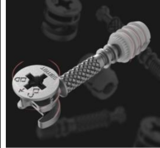
Accessories & Fitting