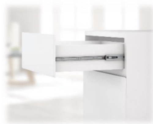
SO CLASS Ball-Bearing Slide Systems